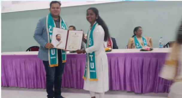
Certificate hand over to student during convocation function