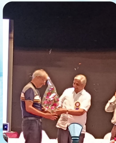
Chhayando felicitation 25.2.24